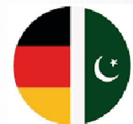
The German Embassy